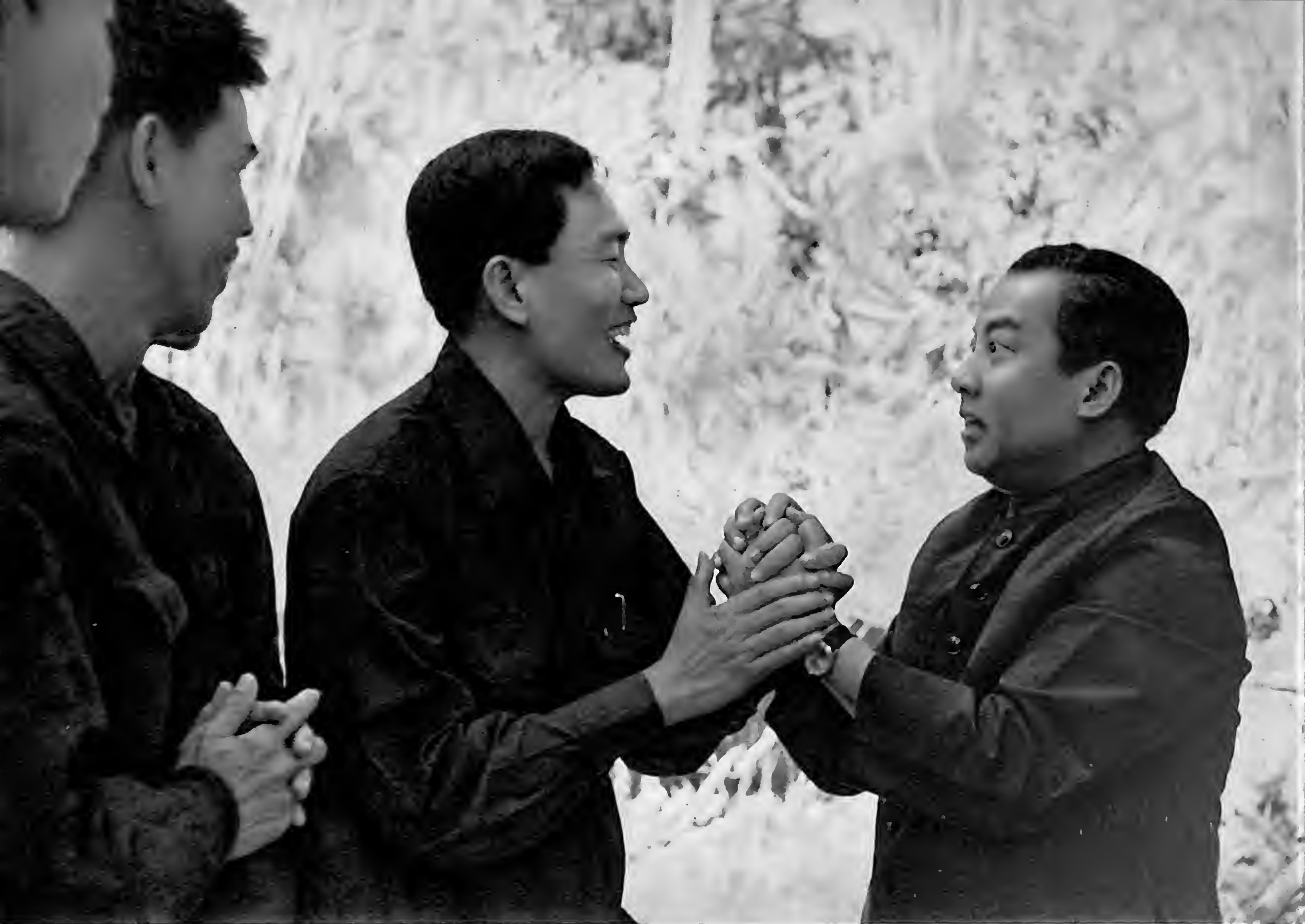
On the border of Cambodia, Minister of Information and Propaganda Hu Nim warmly greets the Head of State on behalf of leaders of the Royal Government of National Union of Cambodia in the interior and expresses the joy of the people on welcoming the Samdech to the motherland.